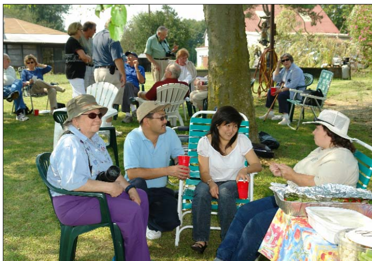
Last year's picnickers were treated to great weather as they enjoyed the pleasant opportunity to get to know one another better over good food and great camaraderie. Don't miss out in this year's fun.