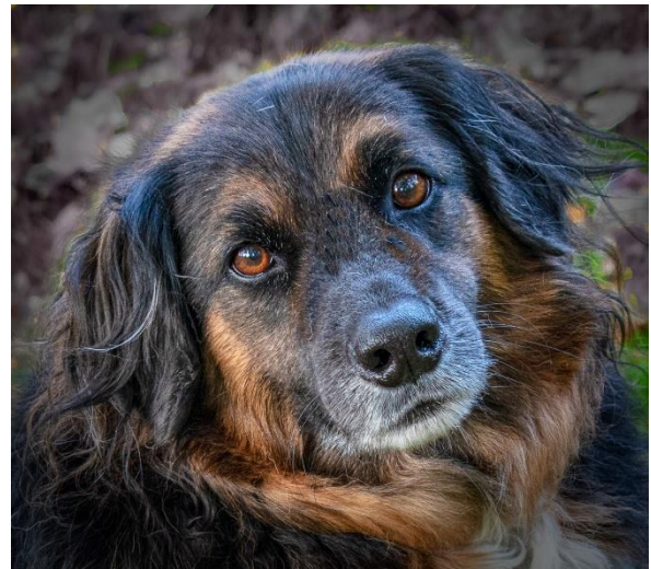
Neighbor Dog by Pauline Jaffe

I enjoy nature photography, including landscapes, birds, flowers, and close-up photography. I joined PSA two years ago and belong to a study group and am excited about the learning and growth that I can achieve as a result of joining PSA!