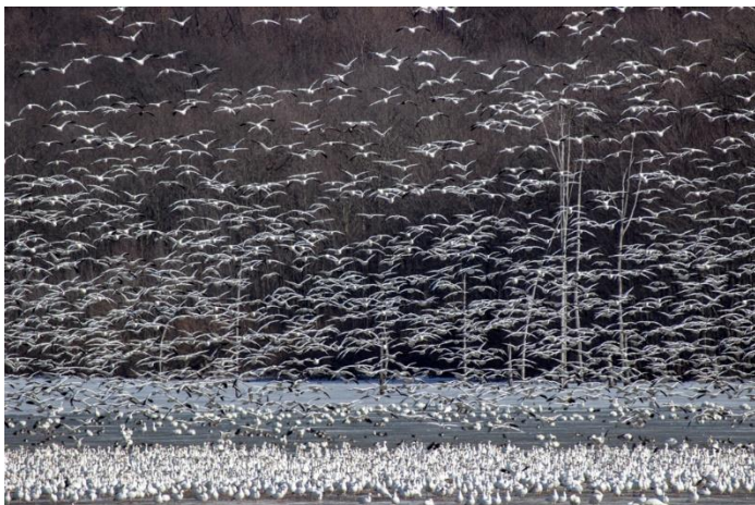
Curtain of Snow Geese