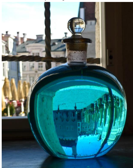
World in a Bottle