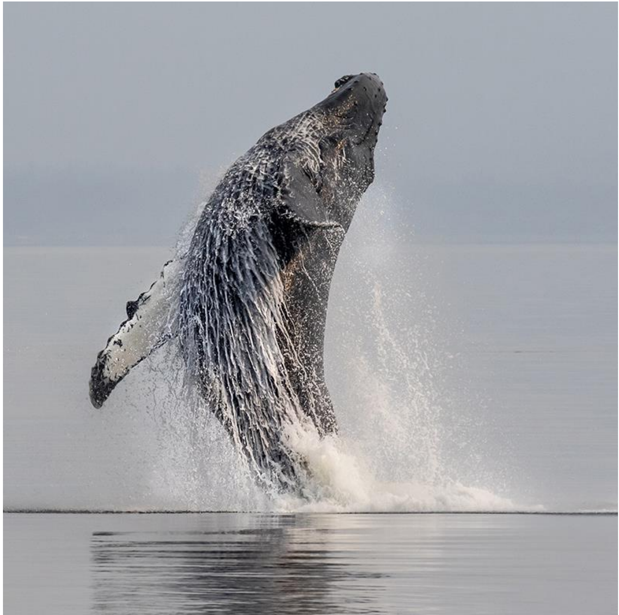
Explosive Humpback Breach by Dee Langevin