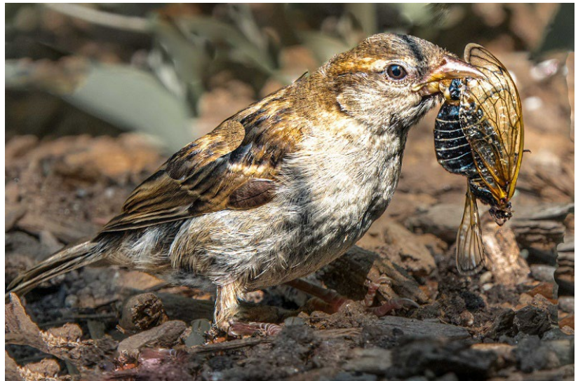
Bird Eating 17 Year Cicada at Leisure World