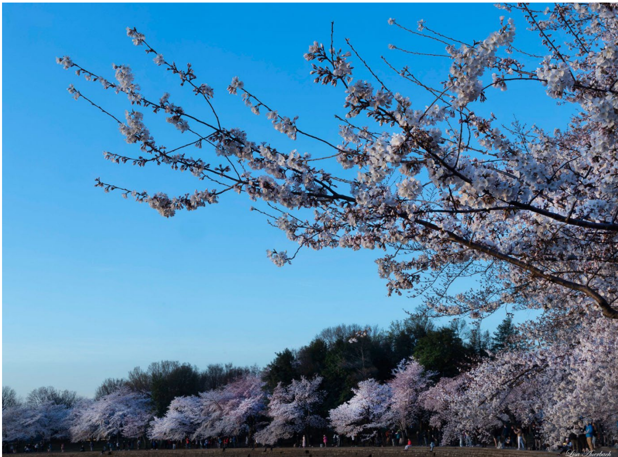
View from Martin Luther King Memorial Looking Toward the Jefferson Memorial