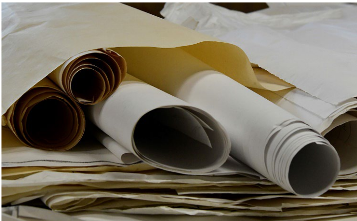
Field Trip Charts