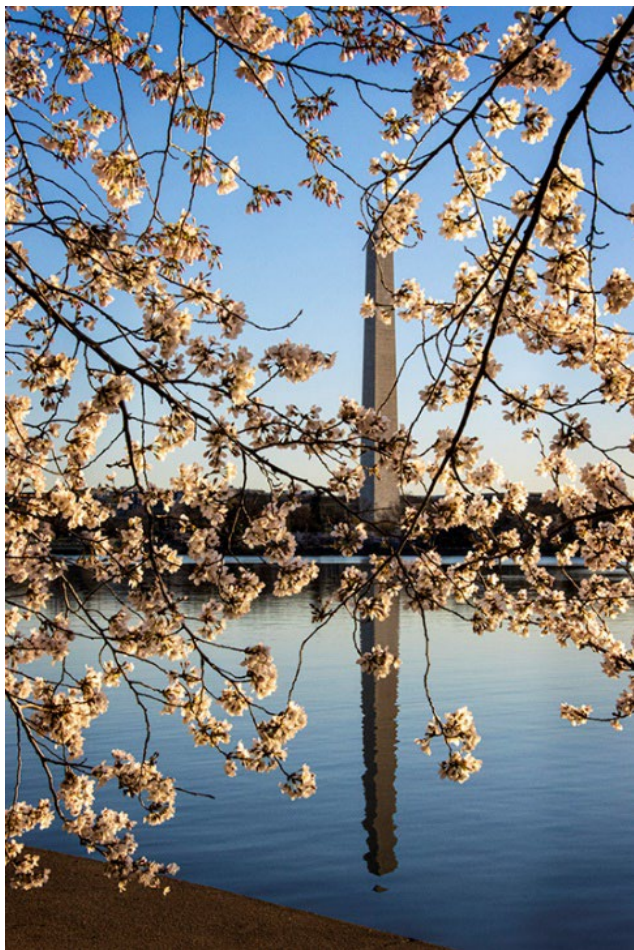
Through the Blossoms

I'm enclosing two pictures, both taken 3/21/22 at the Tidal Basin. They are not my all-time favorites but they are my favorites for 2022 so far.